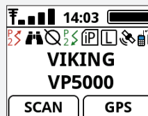
Day - High Contrast